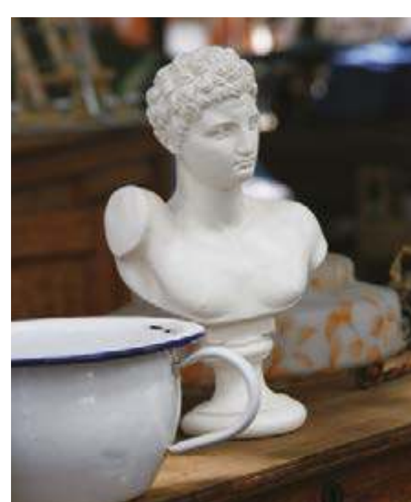
Below Ciney hosts the largest flea market and

It is recommended to show up on the first day of the fair as, by the end of the day, most of the best merchandise will be gone. On Saturday and Sunday visitors usually mostly find "leftovers" such as bulky or expensive items that didn't find any takers or objects in bad condition.