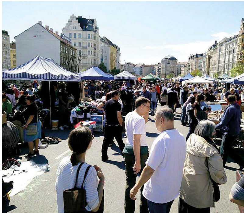
Above left: the Vienna Flohmarkt , next to the Naschmarkt (selling mainly world foods) is the city's largest flea market. Held weekly on a Saturday, it runs from 6.30am-6.30pm.

"I worked there with a vintage interiors shop, Catrinette, and spent all my weekends scouring