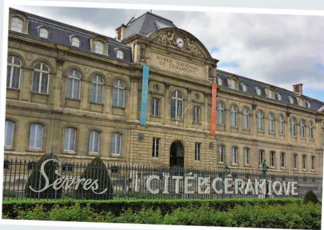
ABOVE: See Sèvres porcelain and more at an exhibition in Paris